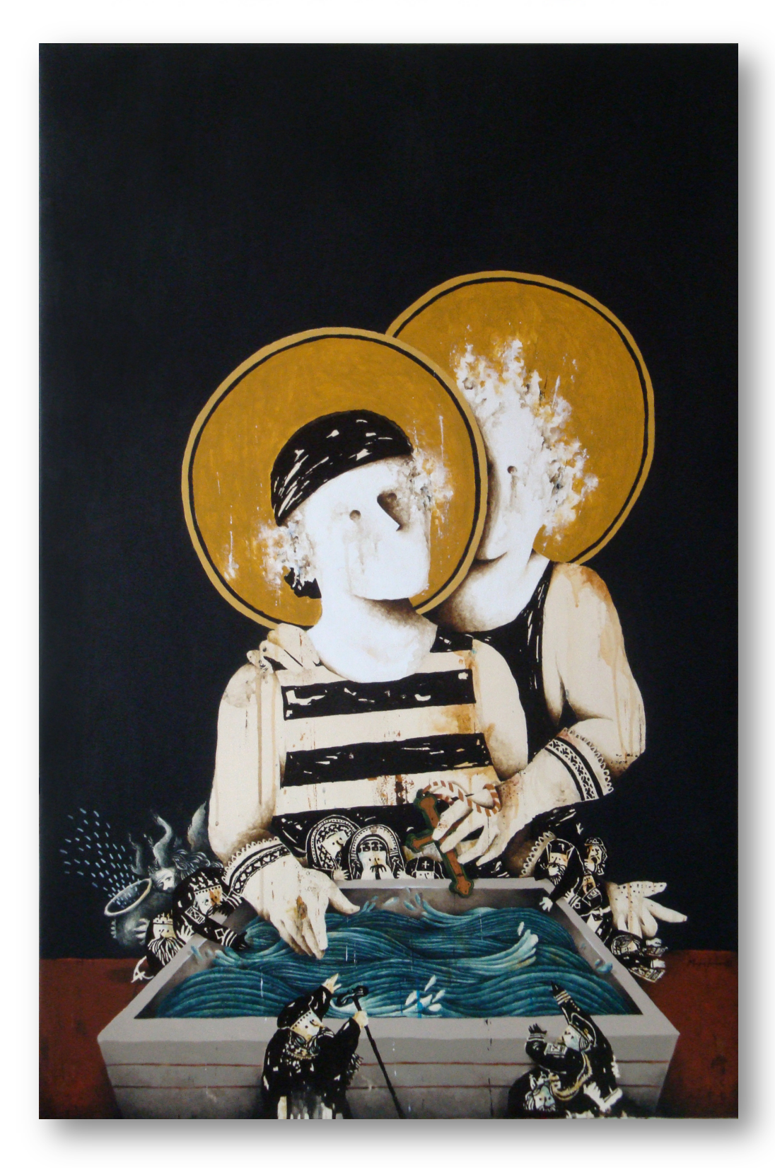
George Maraziotis – Theofania - Mixed media on canvas 43" x 28" / 110 x 70 cm 2012