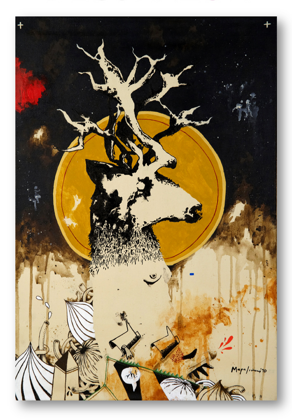
George Maraziotis – Angel - Mixed media on canvas 28" x 20" / 70 x 50 cm 2010