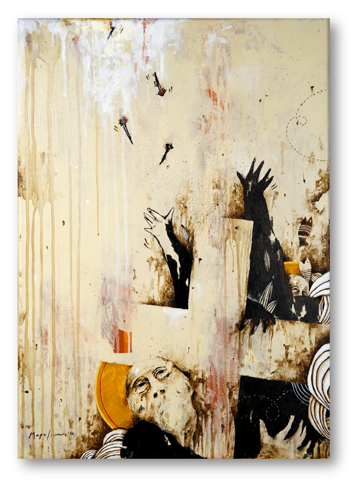
George Maraziotis – Arma Christi - Mixed media on canvas 28" x 20" / 70 x 50 cm 2010