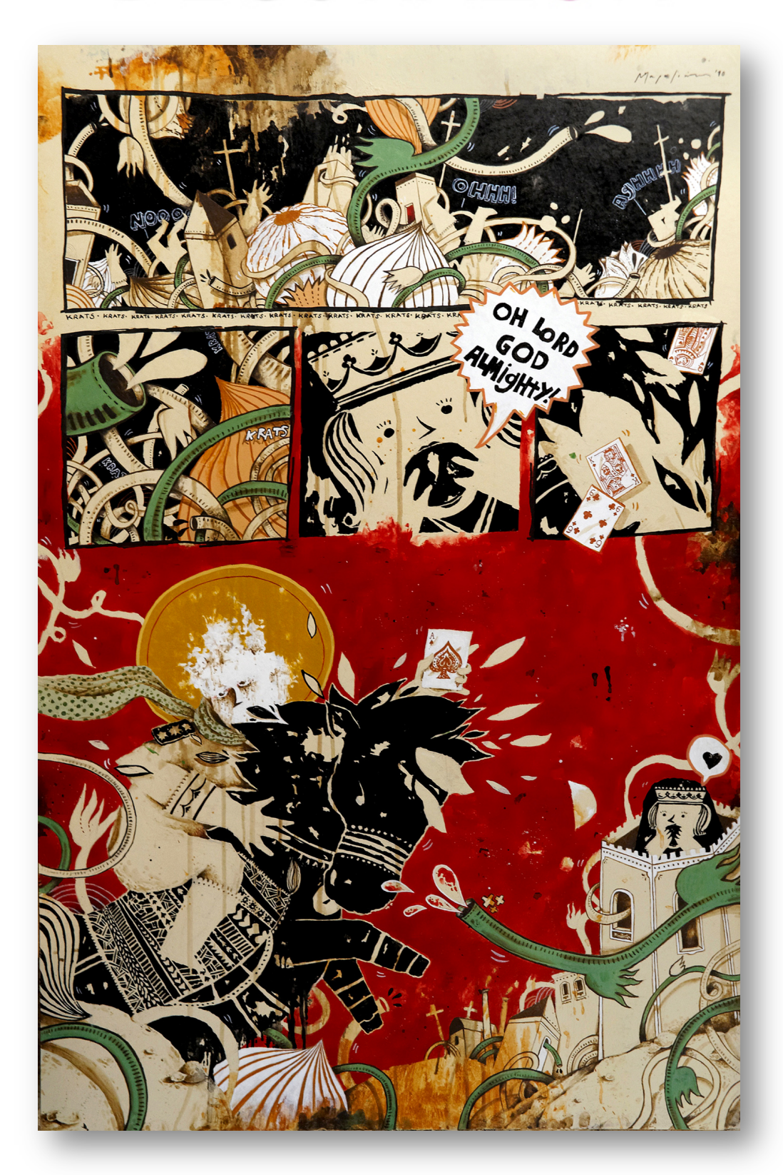
George Maraziotis – Agios Giorgos - Mixed media on carton 39" x 30" / 100 x 75 cm 2010