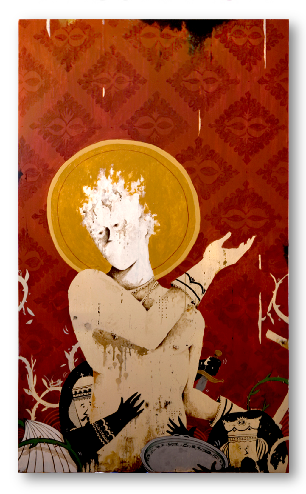
George Maraziotis – St. John - Mixed media on canvas 59" x 35" / 150 x 90 cm 2011

www.DECORAZONgallery.com <u>mk@decorazongallery.com</u> / US: +1 917 292 1227 / UK: +44 (0) 753 827 1220 27 Old Gloucester Street, London, WC1N 3AX / 151 1<sup>st</sup> Ave Suite 213, New York, NY 10003