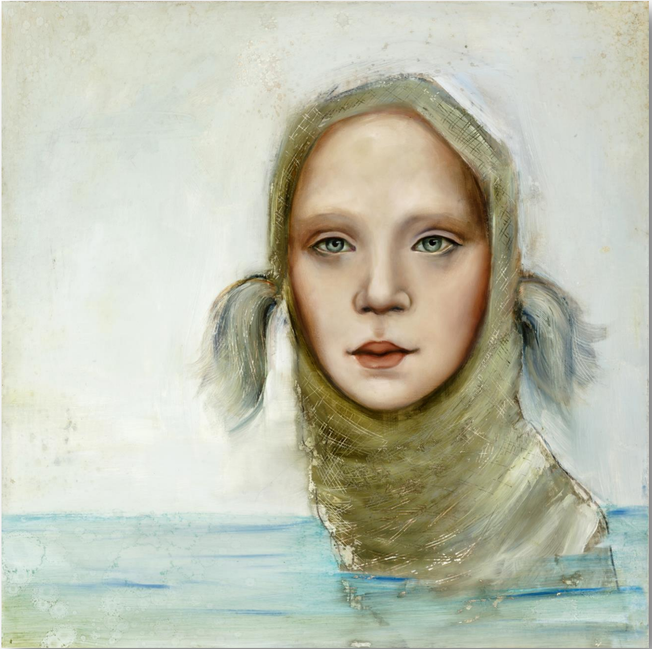
The Myth Maker - Oil and enamel on canvas - 2014 18" x 18" inches / 46 x 46 cm

www.DECORAZONgallery.com info@decorazongallery.com / US: +1 917 292 1227 / UK: +44 (0) 753 827 1220 27 Old Gloucester Street, London, WC1N 3AX UK / 151 1 st Ave Suite 213, New York, NY 10003 USA