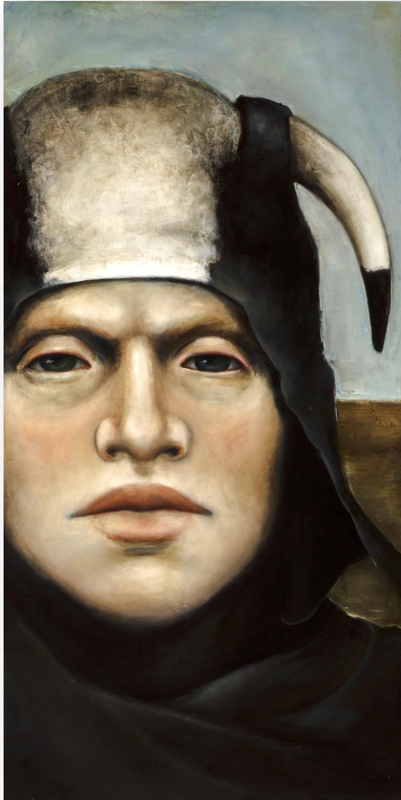
The Bull (Taurus) - Oil and enamel on canvas – 30" x 60" / 76 x 152 cm

www.DECORAZONgallery.com info@decorazongallery.com / US: +1 917 292 1227 / UK: +44 (0) 753 827 1220 27 Old Gloucester Street, London, WC1N 3AX UK / 151 1 st Ave Suite 213, New York, NY 10003 USA