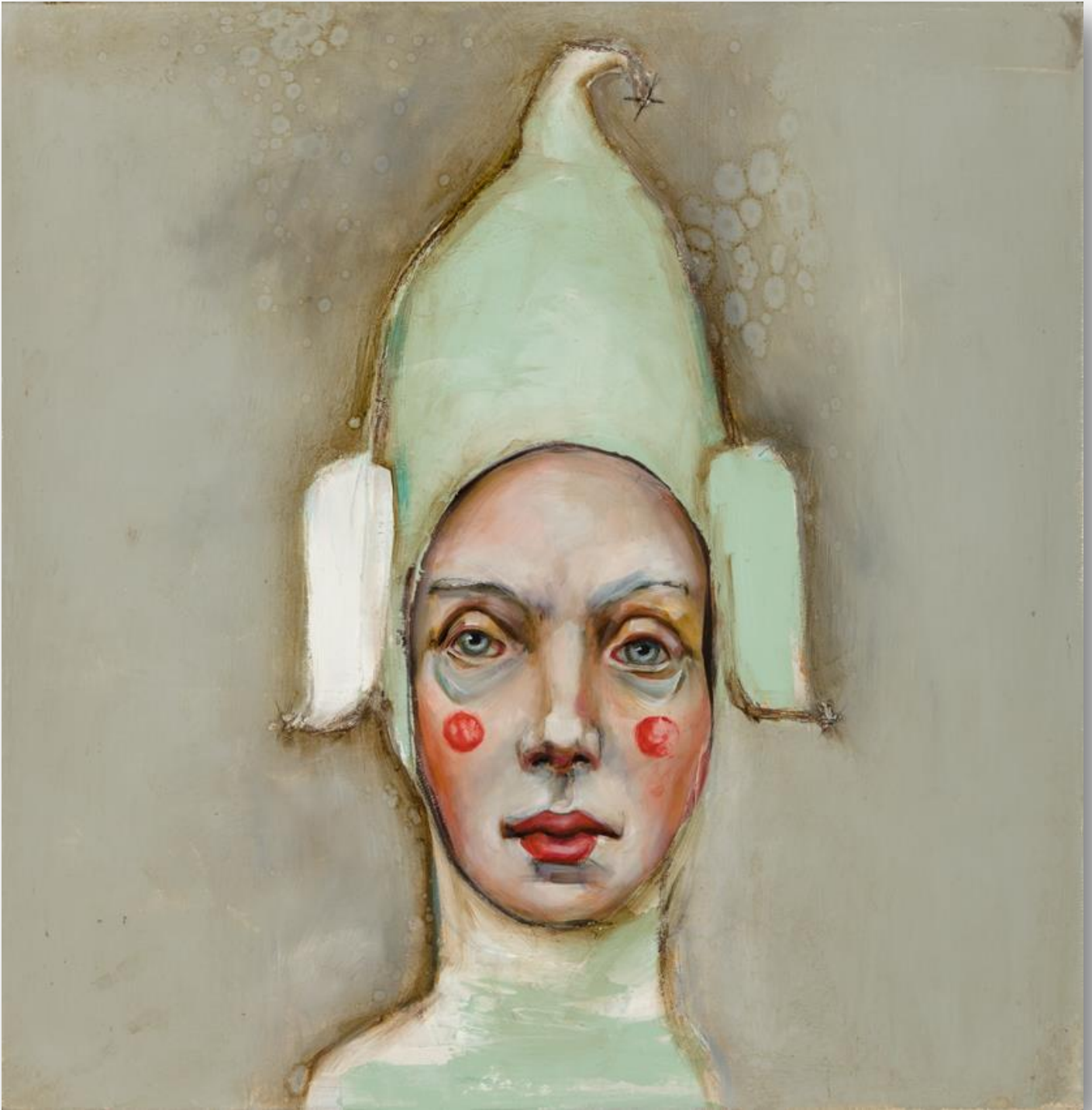
Cat Fish - Oil and enamel on canvas - 2015 12" x 12" / 30 x 30 cm

www.DECORAZONgallery.com info@decorazongallery.com / US: +1 917 292 1227 / UK: +44 (0) 753 827 1220 27 Old Gloucester Street, London, WC1N 3AX UK / 151 1 st Ave Suite 213, New York, NY 10003 USA