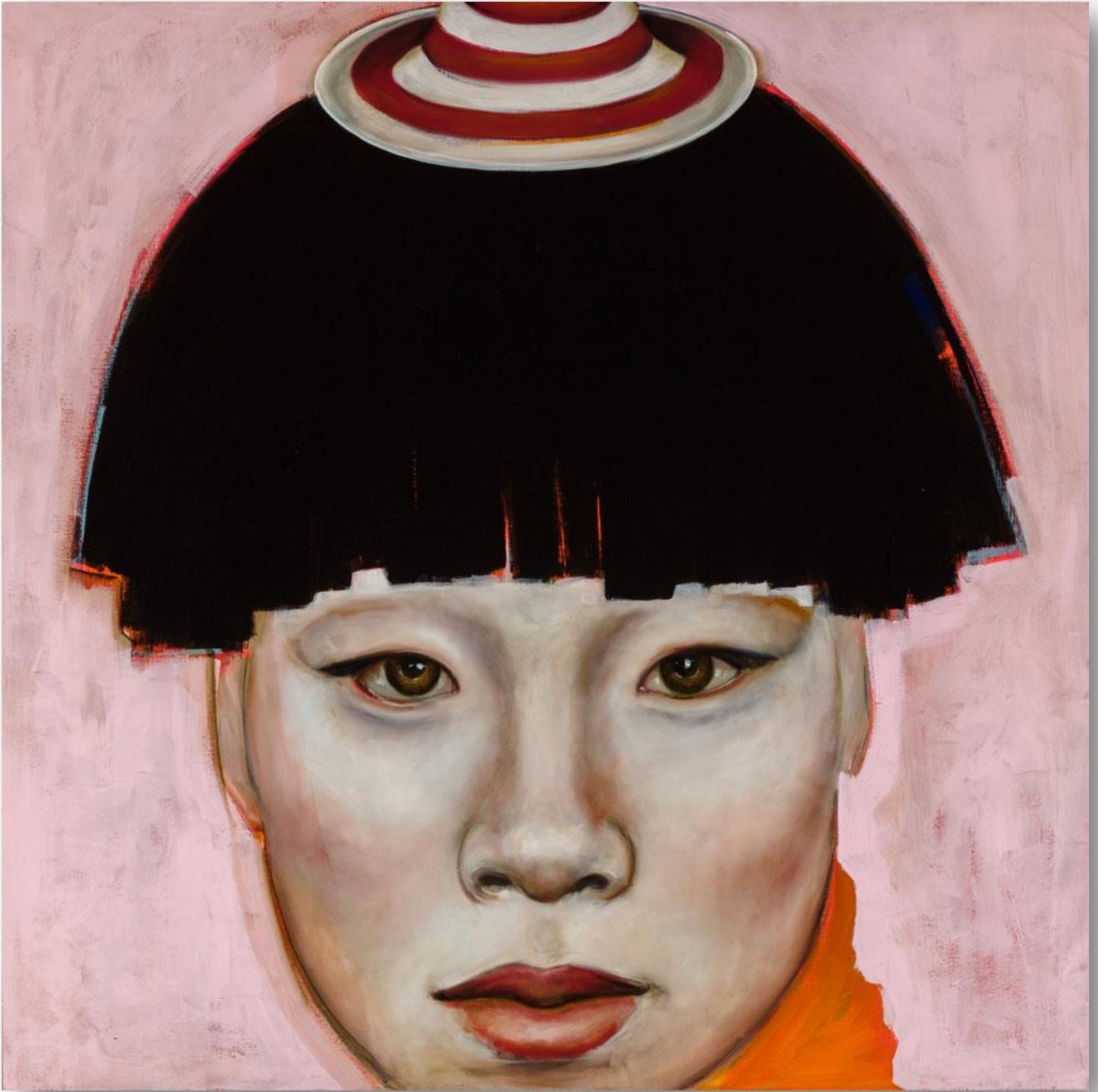
Year of the Ox - Oil and enamel on canvas - 2015 40" x 40" / 102 x 102 cm

www.DECORAZONgallery.com info@decorazongallery.com / US: +1 917 292 1227 / UK: +44 (0) 753 827 1220 27 Old Gloucester Street, London, WC1N 3AX UK / 151 1 st Ave Suite 213, New York, NY 10003 USA