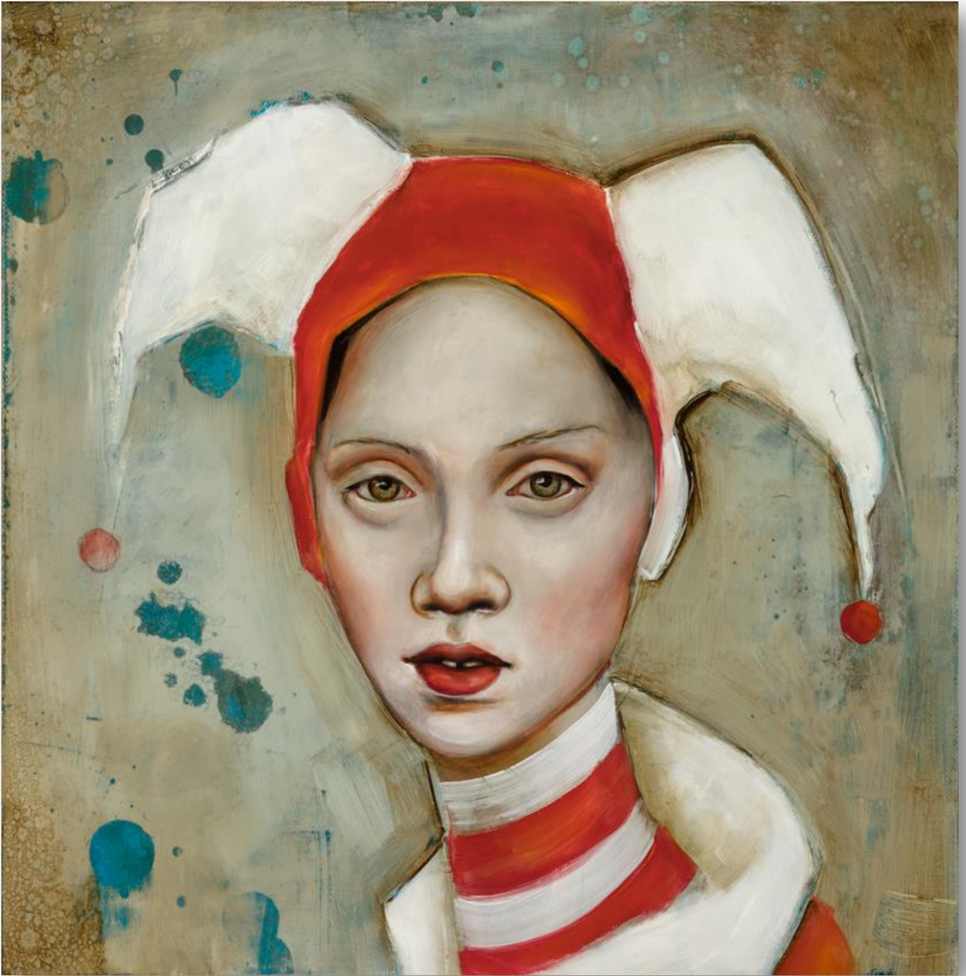
The Albatross - Oil and enamel on canvas - 2015 12" x 12" / 30 x 30 cm

www.DECORAZONgallery.com info@decorazongallery.com / US: +1 917 292 1227 / UK: +44 (0) 753 827 1220 27 Old Gloucester Street, London, WC1N 3AX UK / 151 1 st Ave Suite 213, New York, NY 10003 USA