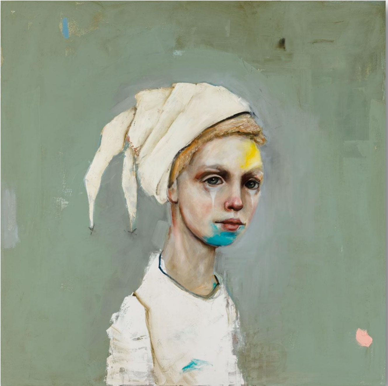
Bubble Gum - Oil and enamel on canvas - 2015 36" x 36" / 91 x 91 cm