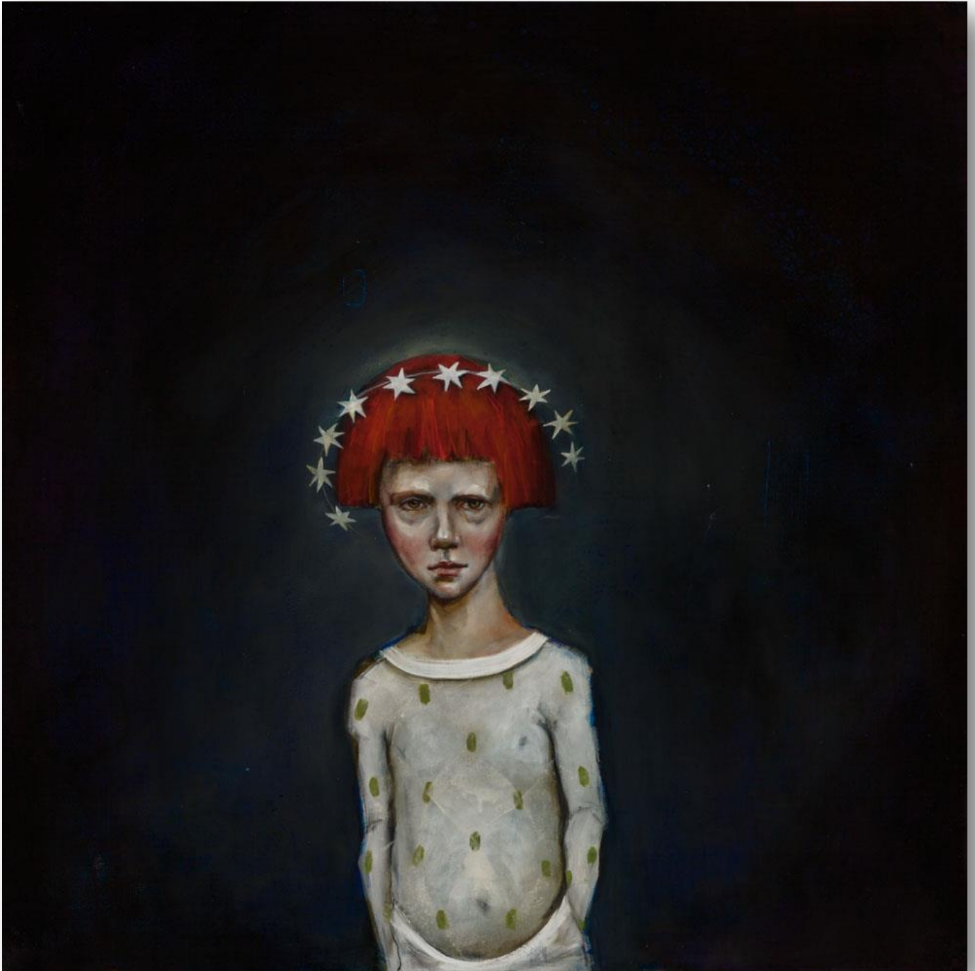
Age Seven - Oil and enamel on canvas - 2015 36" x 36" / 91 x 91 cm

www.DECORAZONgallery.com info@decorazongallery.com / US: +1 917 292 1227 / UK: +44 (0) 753 827 1220 27 Old Gloucester Street, London, WC1N 3AX UK / 151 1 st Ave Suite 213, New York, NY 10003 USA