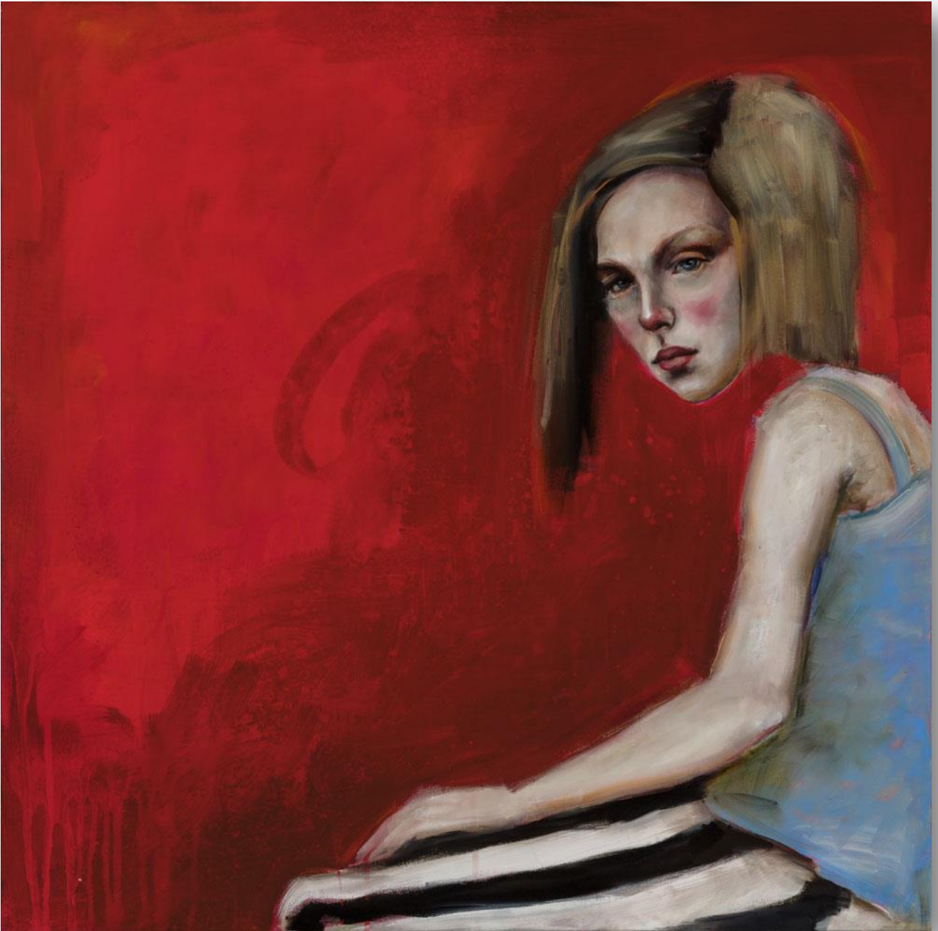
Unfinished - Oil and enamel on canvas - 2015 24" x 24" inches / 61 x 61 cm