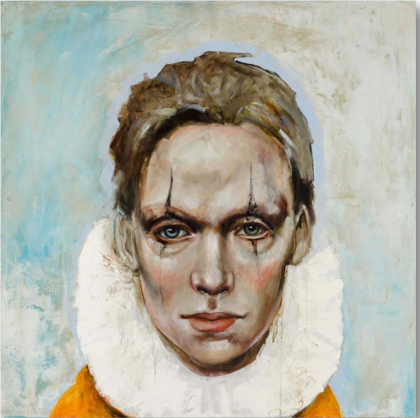
Second Act - Oil and enamel on canvas - 2015 36" x 36" / 91 x 91 cm

www.DECORAZONgallery.com info@decorazongallery.com / US: +1 917 292 1227 / UK: +44 (0) 753 827 1220 27 Old Gloucester Street, London, WC1N 3AX UK / 151 1 st Ave Suite 213, New York, NY 10003 USA