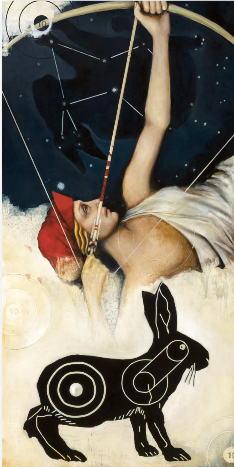
The Rabbit (Sagittarius) - Oil and enamel on canvas – 30" x 60" / 76 x 152 cm