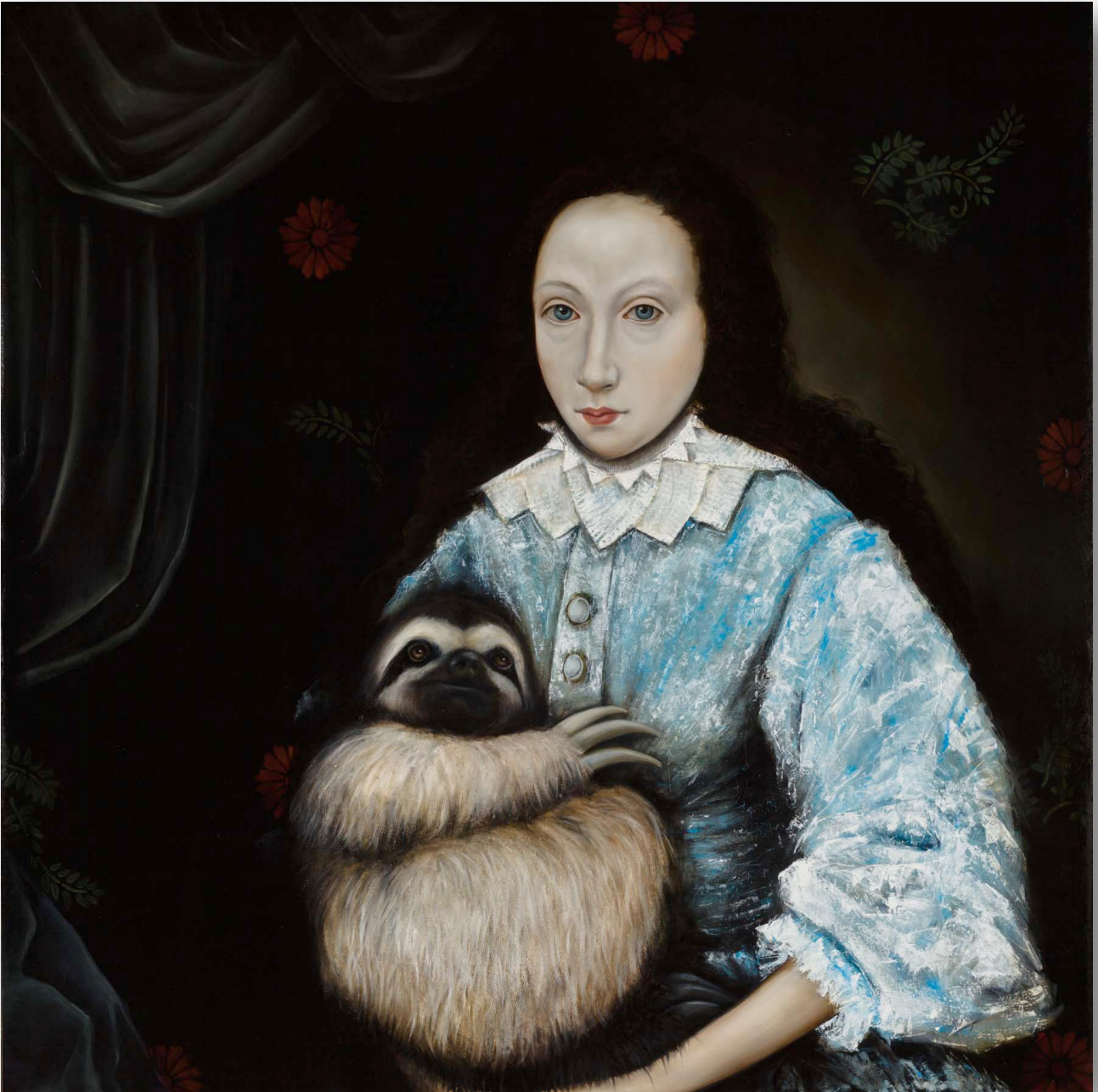
The Misfit - Oil and enamel on canvas - 2014 48" x 48" inches / 122 x 122 cm